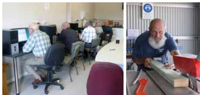
RSL Sheds participants enjoying their activities.

I can now inform you that operations have commenced and our first projects were started on 25th October. Six members commenced computer instruction and a further 5 start construction of wooden work benches. The computer and woodworking sessions will be ongoing. In the near future we will see the commencement of restoration work on a "Bofors Gun". Other activities will be coordinated subject to member request. (See enclosed RSL Sheds flyer).