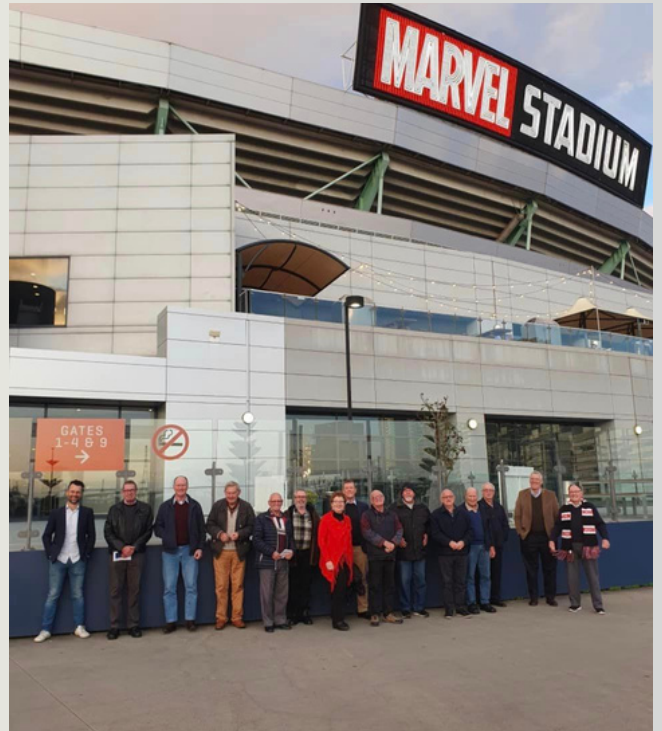
Here's to a good time. A bus load of veterans, all smiles, and ready for the comforts of the Medalion room at Marvel Stadium