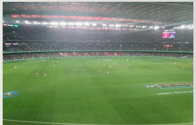
Looks like a mighty fine view from the Medalion room.